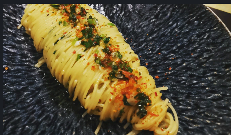
Angel Hair Pasta with E.V.O. Garlic, Chilli, Herbs & Truffle Oil