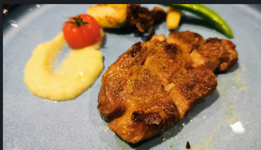
Slow Cooked Iberico Pork Collar