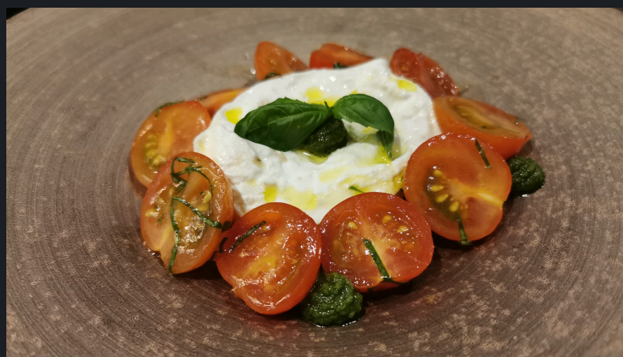
Insalata Caprese ( Cherry Tomatoes, Basil, Burrata Cheese & Pesto )