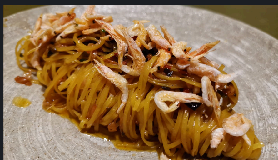
Sakura Ebi Capellini