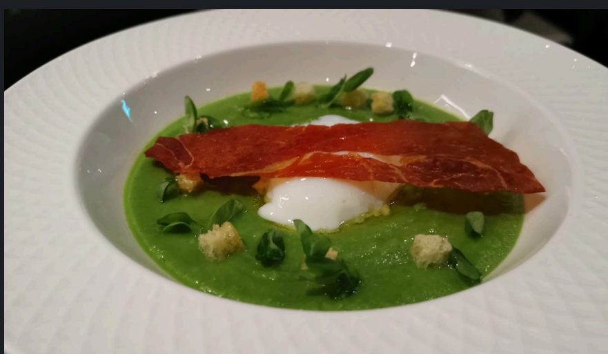
Green Pea Soup with 63 Deg Egg & Parma Ham