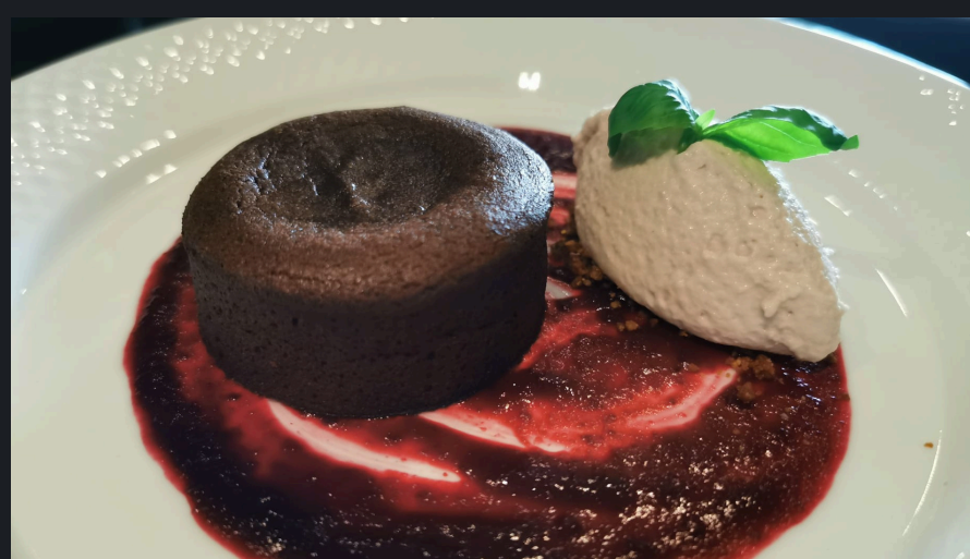
Flourless Chocolate Cake with White Chocolate Mousse