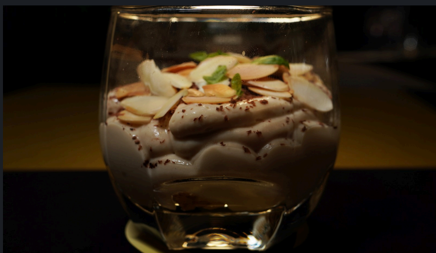
8picurean Tiramisu ( Add $5 )